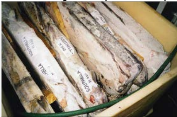
Block frozen H&G