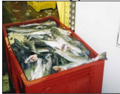
Loose frozen H&G