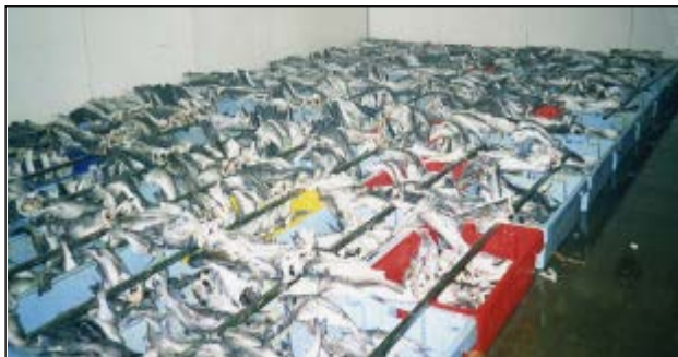
Fig ?- Fish placed on bars above boxes to improve air circulation and product handling

Setting out frozen fish blocks on racks, or bars, above fish boxes. This helps to improve air circulation around the blocks and enables fish to fall into boxes, facilitating handling.