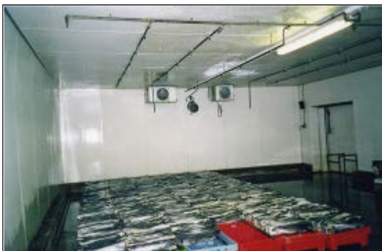
Figure 5? - An example of a simple spray water system for thawing fish blocks

What do you think are the advantages and disadvantages of this simple water spray approach to thawing?